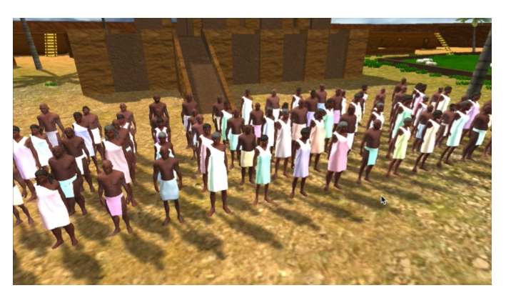
Fig. 4: Generated Crowd in Unity 3D

Then, using approaches from genetic algorithms, by combining chromosomes from two parents we reproduce the rest of the population automatically, where each new avatar is unique. Figure 4 depict a generated crowd of 100 agents in Unity3D.