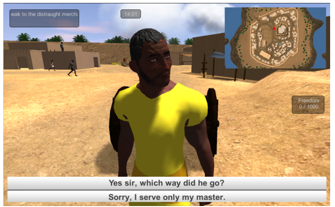
Fig. 6: Streets of Uruk

simulation and means of interacting with the Uruk simulation. In order to best educate simulation participants we have decided to create a simple plot, which human participant can follow in order to best discover the city, its history and the sumerian culture occupying it. To follow this plot, human has to interact with agents and object to listen to their stories. The dialogue trees have been implemented using the NodeCanvas plugin, which also visualises dialogues in the game. Figure 6 depicts an interaction with one of the agents. It also shows the simple game interface with the mini-map and several GUI elements showing the progress in the game.