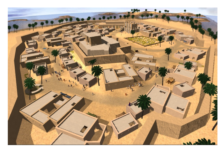
Fig. 1: 3D Visualisation of the city of Uruk 3000 BC

with models of physiological needs, so that agent goals can be automatically generated through these needs (like hunger, thirst, fatigue, etc.) becoming more pronounced. The agents must have a way to react to these needs in a way appropriate for the social role the agent is playing in the reconstructed society. Thus, to make this possible we formalise the role flow and social norms of the reconstructed society (that we label as institution). The institution permits agents to find a plan of actions that leads to satisfying each of the needs, while keeping this plan in accordance with the role played by the agent. Finally, to increase believability and improve diversity of agent actions we supply agents with diverse personalities, so that actions of others and the state of the environment may affect an agent's emotional state and result plan variations in response to the same goal. Further we highlight the technical details of the aforementioned techniques. This process is separated into six steps, following the methodology from [2].